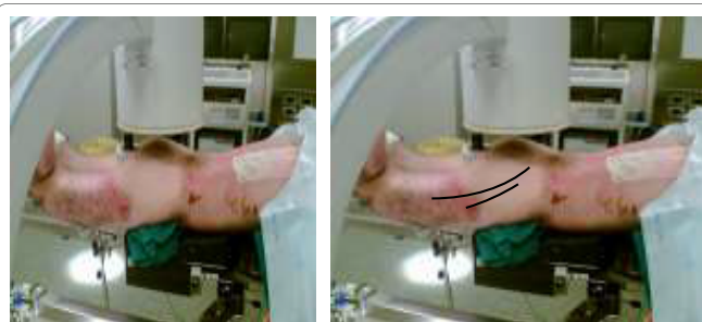
Figure 2: Surgical position, skin abrasion, K-L and minimal access