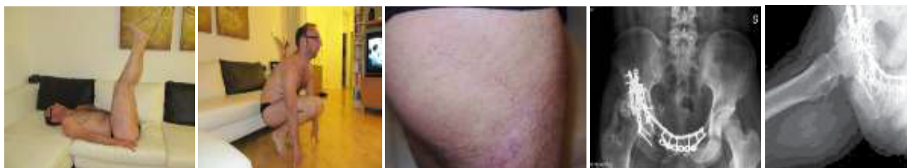
Figure 4: Mobility and radiographs after 8 years

The incision started from the distal part of the K-L approach. It finished 1 cm proximal to the greater trochanter (Figure 3); the external rotators protected the sciatic nerve, which was in continuity without hematoma. We reduced the posterior wall fracture by positioning a transverse screw and three stainless-steel plates using fewer screws possible to avoid difficulties with the second stage surgery via the ileo-inguinal approach (Figure 4). The first stage surgery took 70 minutes with 350 ml of blood loss.