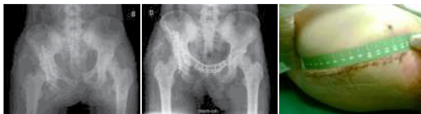
Figure 3: Stepwise post-operative radiographs and skin incision